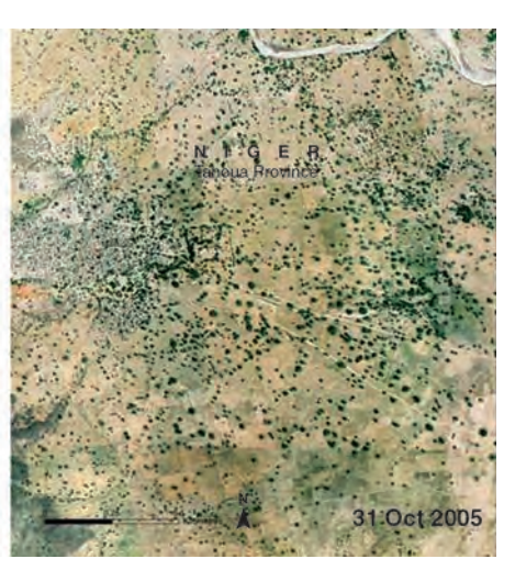
Fig. 2. An example of a major successful sustainable agriculture project. Niger was strongly affected by a series of drought years in the 1970s and 1980s and by environmental degradation. From the early 1980s, donors invested substantially in soil and water conservation. The total area treated is on the order of 300,000 ha, most of which went into the rehabilitation of degraded land. The project in the Illela district of Niger promoted simple water-harvesting techniques. Contour stone bunds, half moons, stone bunding, and improved traditional planting pits (zai") were used to rehabilitate barren, crusted land. More than 300,000 ha have been rehabilitated, and crop yields have increased and become more stable from year to year. Tree cover has increased, as shown in the photographs. Development of the land market and continued incremental expansion of the treated area without further project assistance indicate that the outcomes are sustainable ( 51 , 52 ).

metrics of sustainability, a major problem when evaluating alternative strategies and negotiating trade-offs. This is the case for relatively circumscribed activities, such as crop production on individual farms, and even harder when the complete food chain is included or for complex products that may contain ingredients sourced from all around the globe. There is also a danger that an overemphasis on what can be measured relatively simply (carbon, for example) may lead to dimensions of sustainability that are harder to quantify (such as biodiversity) being ignored. These are areas at the interface of science, engineering, and economics that urgently need more attention (see Box 1). The introduction of measures to promote sustainability does not necessarily reduce yields or profits. One study of 286 agricultural sustainability projects in developing countries, involving 12.6 million chiefly smallholder farmers on 37 million hectares, found an average yield increase of 79% across a very wide variety of systems and crop types (27). One-quarter of the projects reported a doubling of yield. Re-